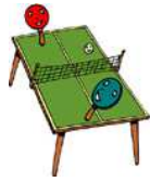
Table Tennis aka Ping Pong

been very appreciative of our group's hard work and kind spirit. Residents with a desire to stitch or knit are invited to join this group. We meet every Wednesday at 1:00 p.m. in the Sloan Clubhouse. Help and supplies are always available.